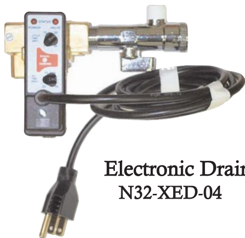
Electronic Drain N32-XED-04

Available 1/4" NPT and 3/8" NPT (PC-02) (PC-03)